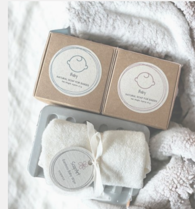
BABY SOAP SA24004

We are dedicated to crafting products that have nourishing and healing qualities using only the best ingredients that nature has to offer.