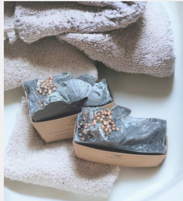
BAR SOAP SA24001