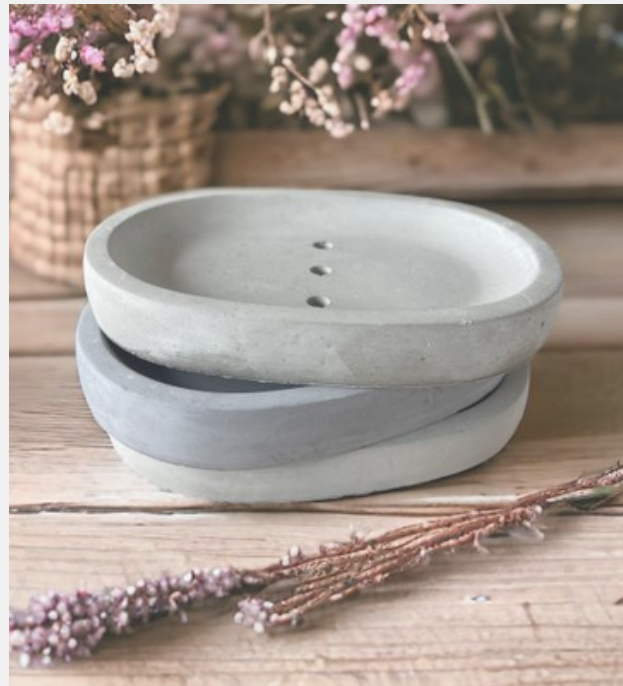
SOAP DISHES SA24008