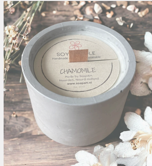
SOY CANDLES SA24009